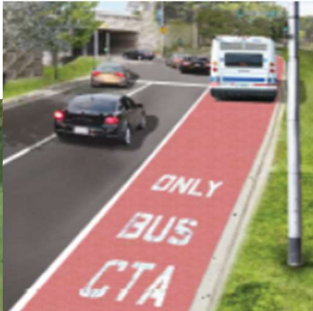
Queue Jump Lanes