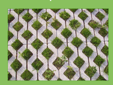
Examples of pervious pavement