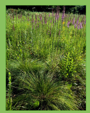
Plantings and vegetation would also be used to filter and manage stormwater