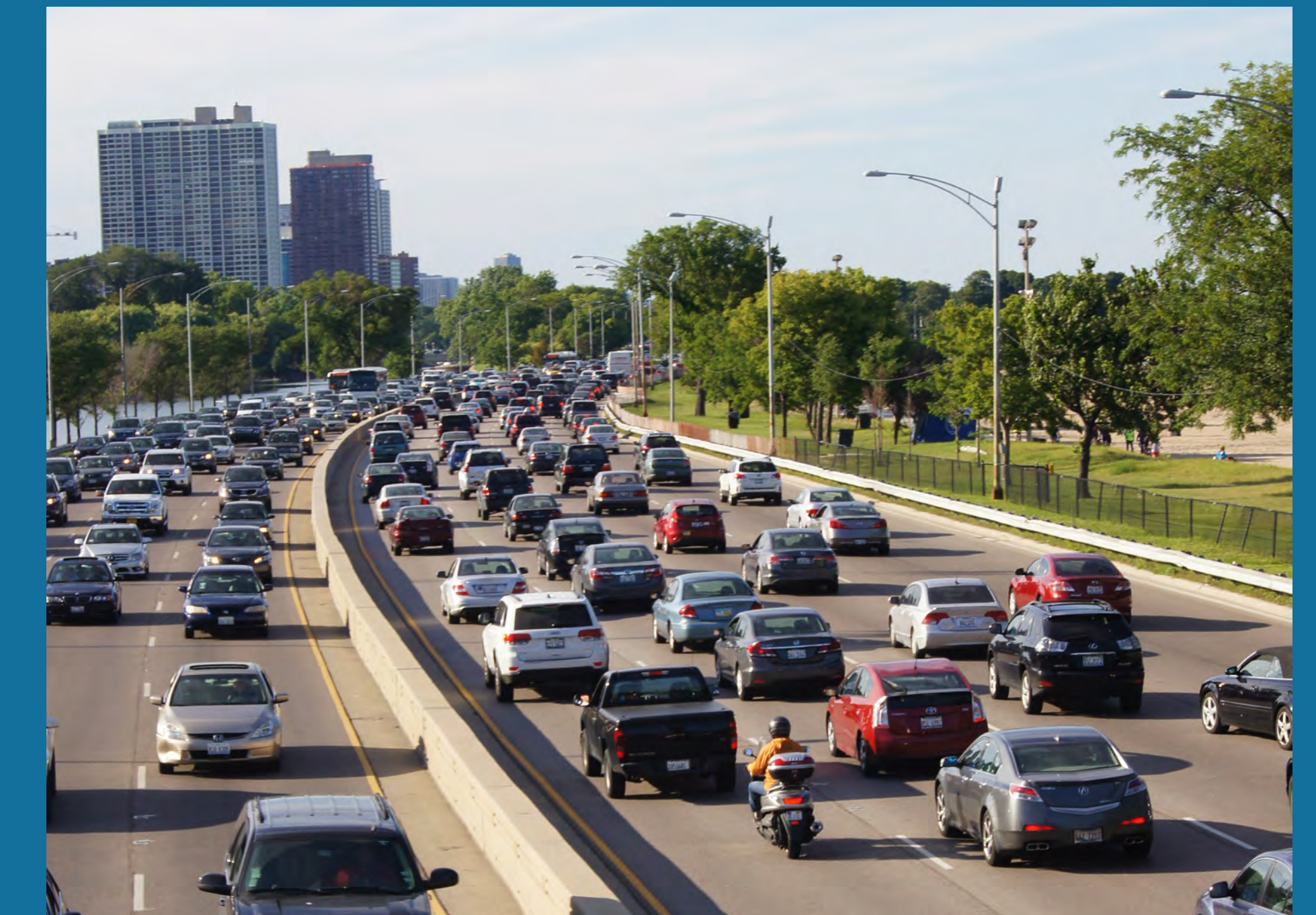
Congestion on NDLSD

NDLSD is a critical regional facility for all users, providing access vital to the City's economy, while remaining an important part of Lincoln Park's history.